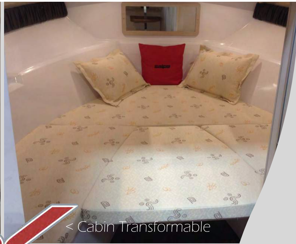
< Cabin Transformable