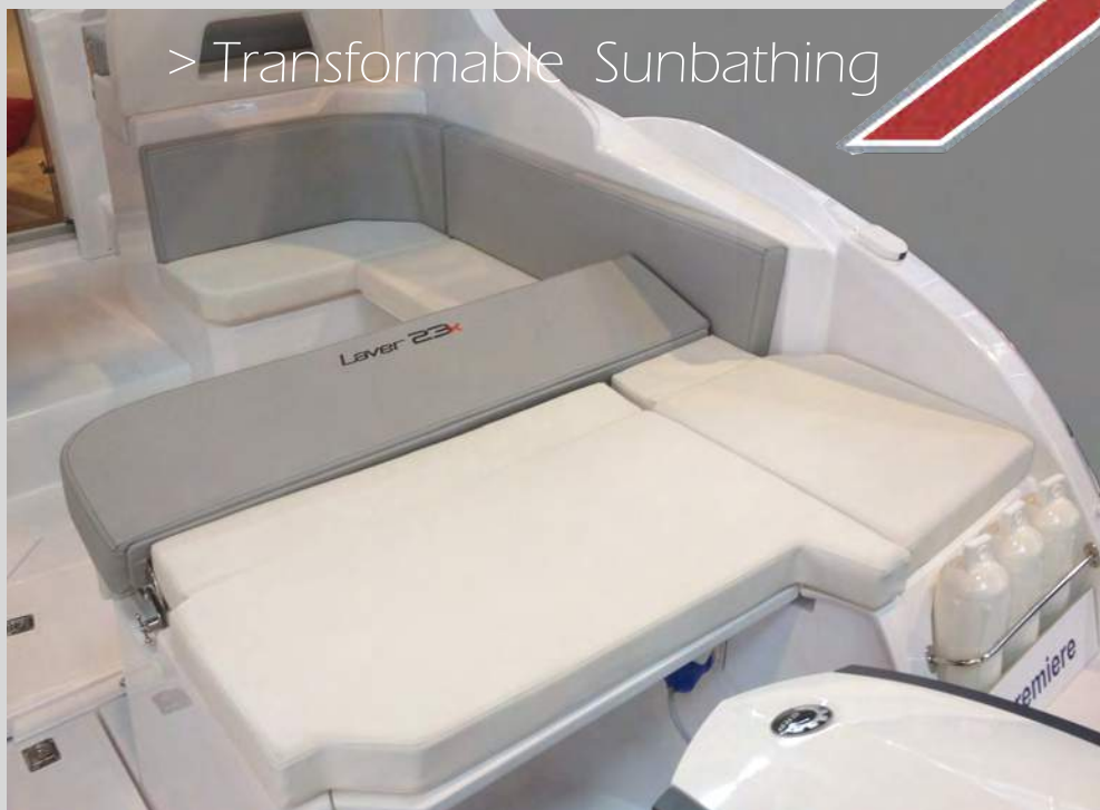
> Transformable Sunbathing