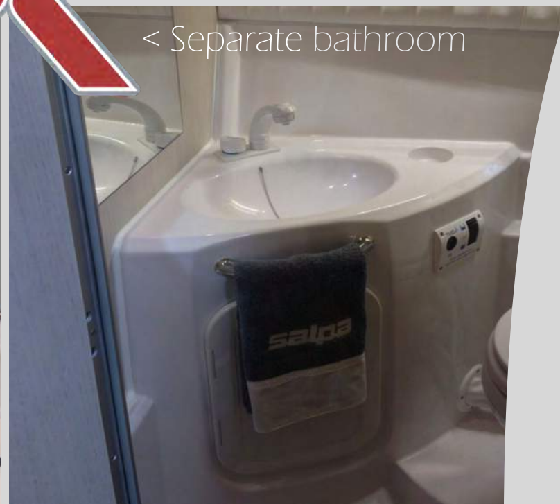
< Separate bathroom